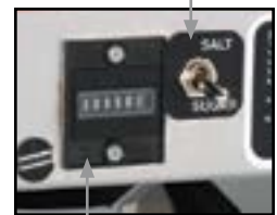
Patented One-Pop Counter Option