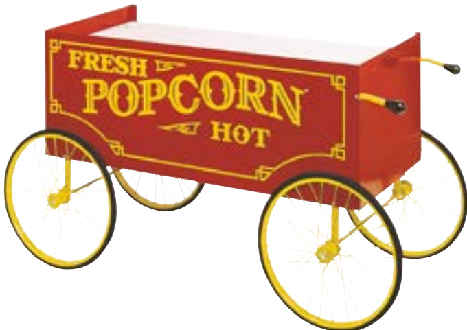
Standard Four-Wheel Red Antique Wagon Base