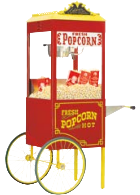
Red Two-Wheel Wagon