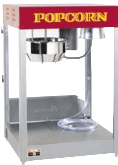
T-3000 Plus Red Top