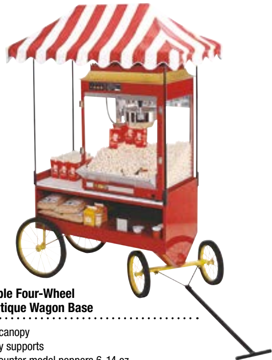
Steerable Four-Wheel Red Antique Wagon Base