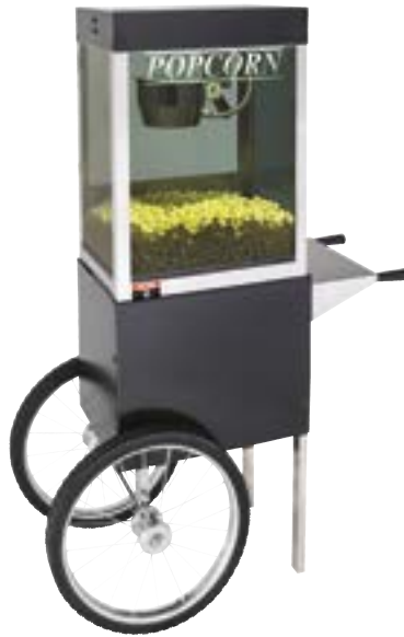
Black Two-Wheel Wagon