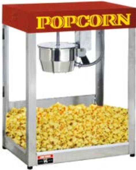
Goldrush Red Top

Small but mighty. Whether you are popping corn at home, a convenience store, a school or a cafeteria, C. Cretors and Company makes it easy and effortless with our small 6 oz poppers. They're perfect for work, school, or a store. Cretors popping equipment combines clean design and exceptional technology with unsurpassed durability. Helping you to pop delicious popcorn each and every time.