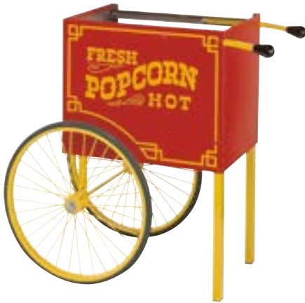
Knock Down Wagon (shown assembled)

Charmingly reminiscent of Cretors wagons and poppers from 100 years ago, you can combine one of our wagon bases with either the standard or antique small concession poppers. Not only do our bases increase versatility and mobility, when strategically placed, our poppers become easy to spot and work hard to increase sales. They're ideal for locations where the counter model popper is not practical or a small floor model or mobility is needed.