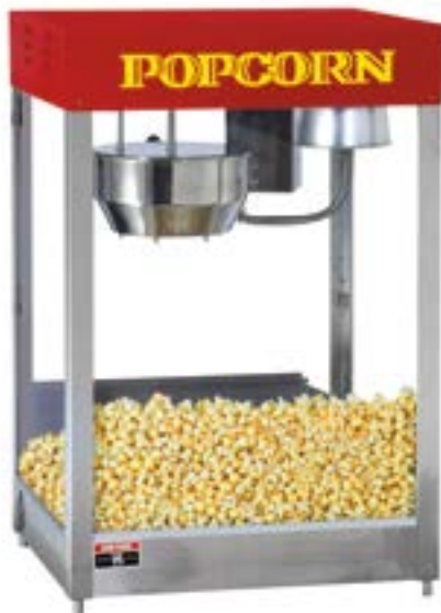
T-3000 Red Top

With an almost 50% increase in popcorn production over the T-2000, the T-3000 is the gateway in the Cretors small popper line to our large popcorn machines. The T-3000 Plus and the Profiteer are the only small concession poppers that are equipped for automatic oil pumps. The T-3000 Plus also has the hot air Cornditioner system, providing large machine capabilities in a small machine footprint.